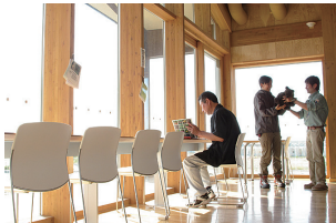
Enjoy a break while reading books about Shiretoko at the Rest Area.