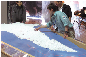
1:25,000 scale relief map highlights points of interest around Shiretoko.