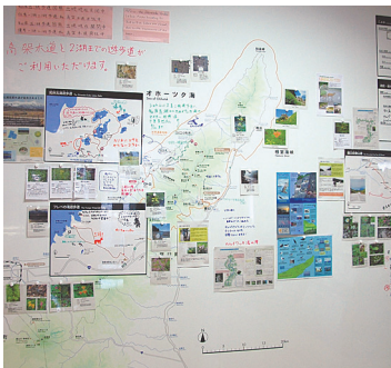
The Information Board allows visitors to check footpath and road conditions, as well as ship arrival and departure schedules.