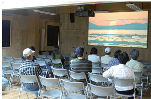
Learn about Shiretoko through movie presentations in the Lecture Room.