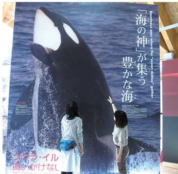
Life-sized animal photograph display.