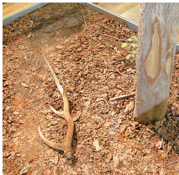
Models of traces left by animals (sika deer antler rubbings on tree bark and more).