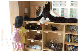
Hands-on learning made fun, with life-sized stuffed animals and more.