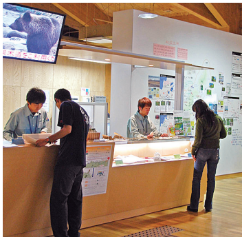
The Information Desk provides seasonal nature information.

The Shiretoko World Heritage Conservation Center displays life-size photos of brown bears, sika deer and other animals living in Shiretoko, and models of claw marks of brown bears and other traces left by animals. It also showcases the magnificence of Shiretoko's nature and gives rules that must be observed by visitors. It provides real-time information on the sights and nature of the Shiretoko World Heritage site and the latest information on the management of the site.